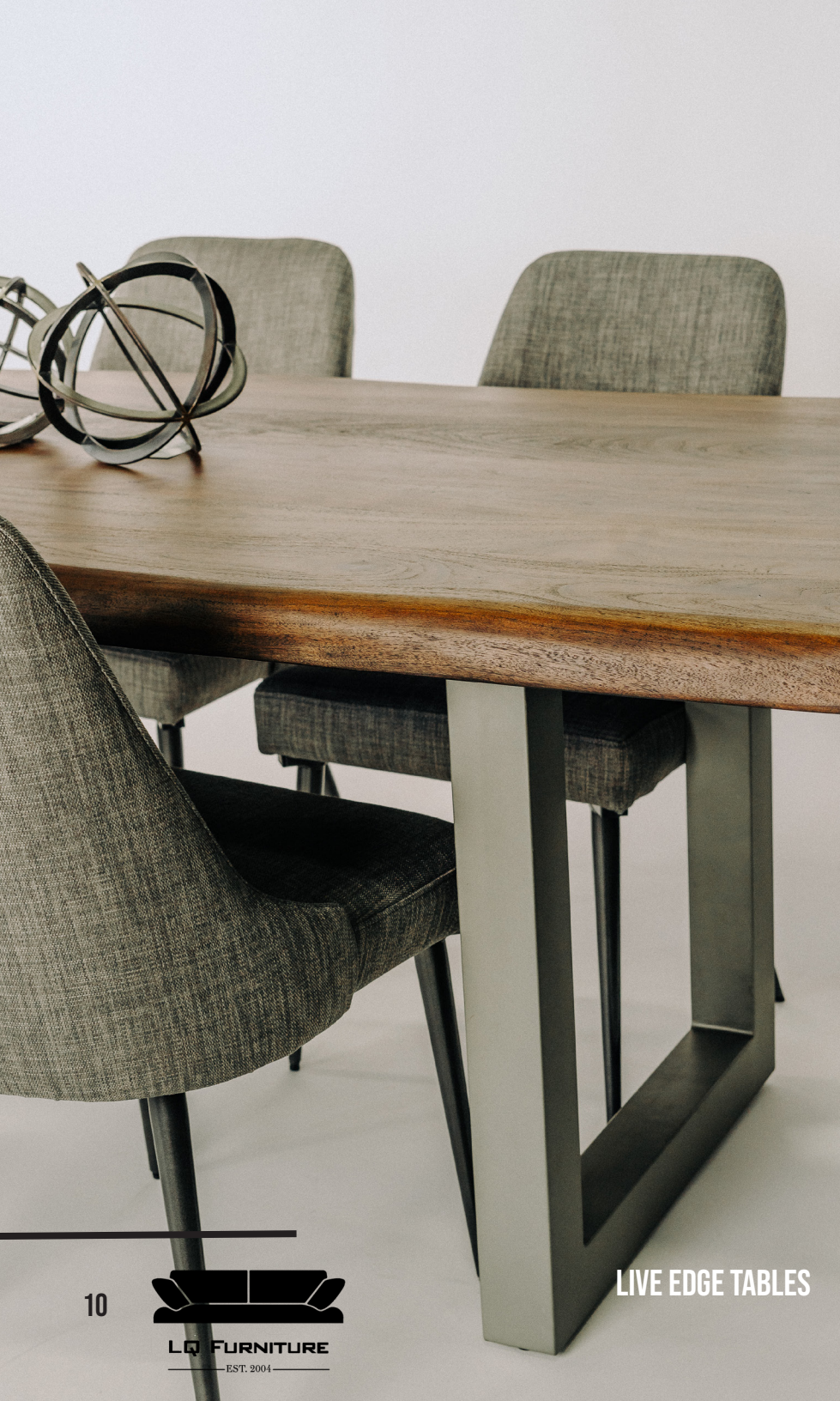
LIVE EDGE TABLES